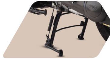
PATENTED E-Z* CENTRE-STAND Eases the strain on the legs with the stable, easy-to-operate centre-stand.