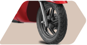
LARGE ALLOY WHEELS + FRONT TELESCOPIC SUSPENSION + REAR GAS CHARGED MONO-SHOCK ABSORBER Makes riding on uneven roads safe and smooth.