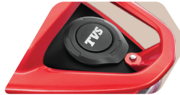
EXTERNAL FUEL FILL + BODY COLOURED PILLION GRAB RAIL The conveniently placed fuel lid lets you fuel-up the scooter without getting off it. And the pillion grab-rail seamlessly features the scooter's body colour.