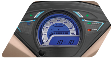
FULL DIGITAL SPEEDOMETER A precise, easy-to-read, blue-lit speedometer. It features a service reminder, low battery indicator, tripmeter, odometer and digital clock.