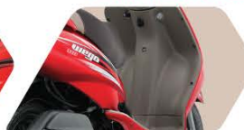
BROWN OAK PANELS