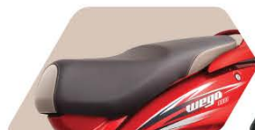
DUAL-TONE SEAT COVER