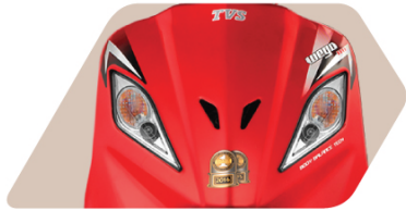
FULL METAL BODY Ensures safety. Metal body with unique weight distribution gives TVS Wego its low weight and high durability.