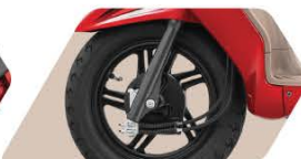
SYNCHRONIZED BRAKE SYSTEM